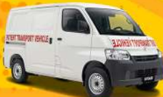
PATIENT TRANSPORT VEHICLE