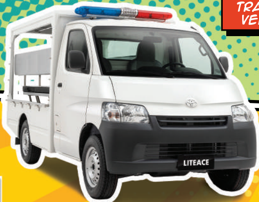
PATIENT TRANSPORT VEHICLE